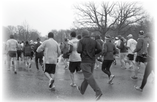
The runners start the 8 mile walk/run at Paris Landing State Park.