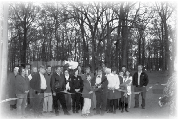
A ribbon cutting for Light Up the Lake was held on opening day.