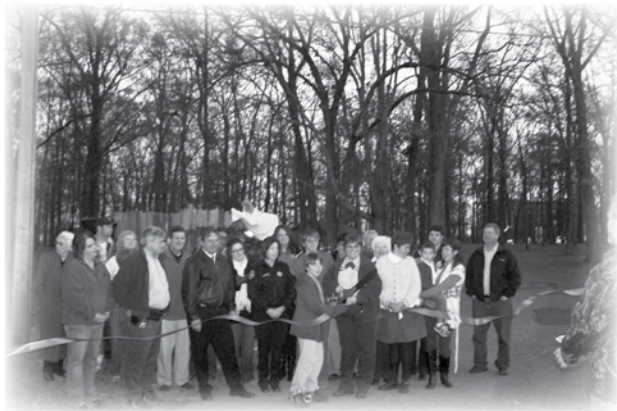
A ribbon cutting for Light Up the Lake was held on opening day.